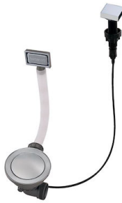
Space automatic waste fitting - PA 8407 108