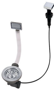
Automatic waste fitting - PM 8407 113