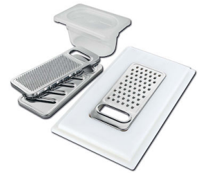
Graters kit with ring-holder and food collection tray

8159 101 * only in combination with the accessory 8644 101