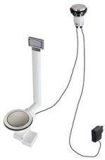
Space Light automatic waste fitting - PL 8407 117