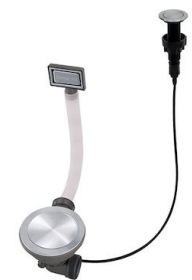
Space Push automatic waste fitting - PP 8407 116