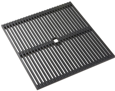
Black grid 8100 600