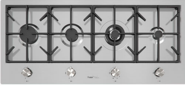
Cooker hob Foster Milano 7640 000