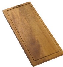
Walnut-wood chopping board 8642 000

* only in combination with the accessory 8644 101